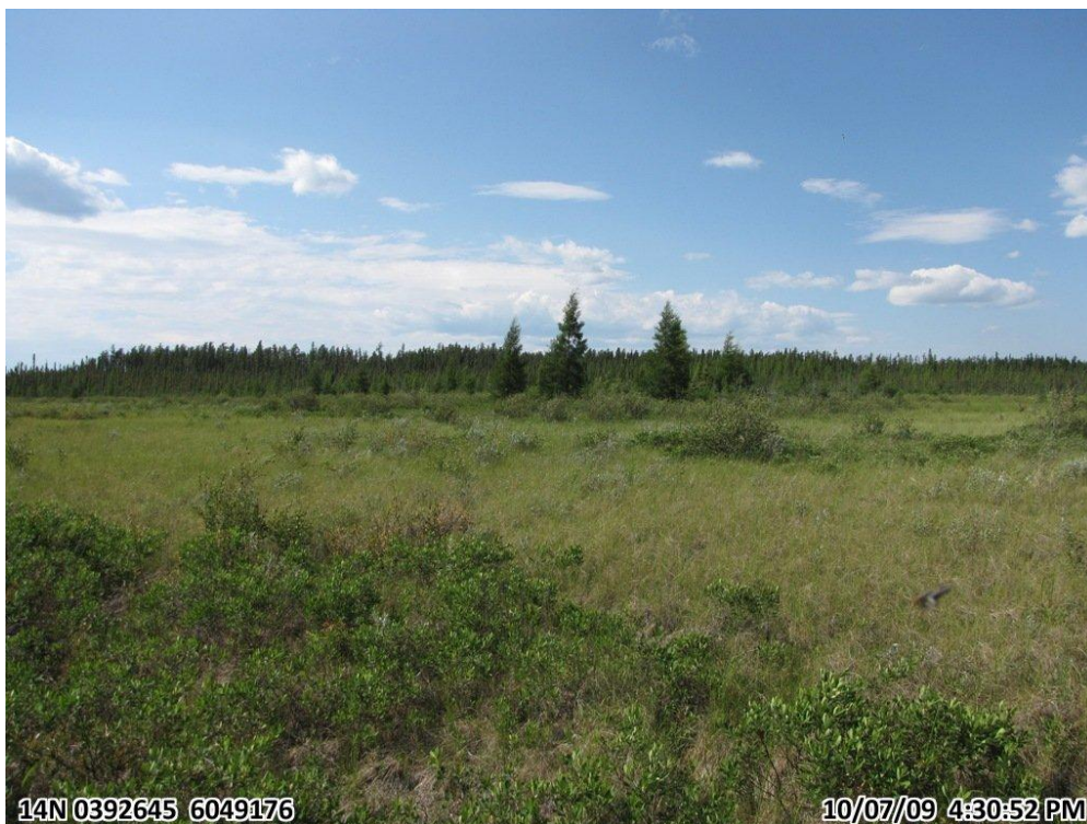
Photo - 08. Wet Fen and Meadow north of Unnamed Lake 2 looking N ↑