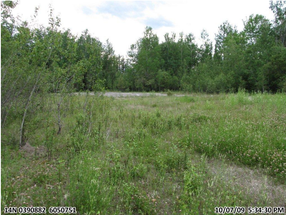
Photo - 11. Asphalt pad from former structure at west end of site ↑