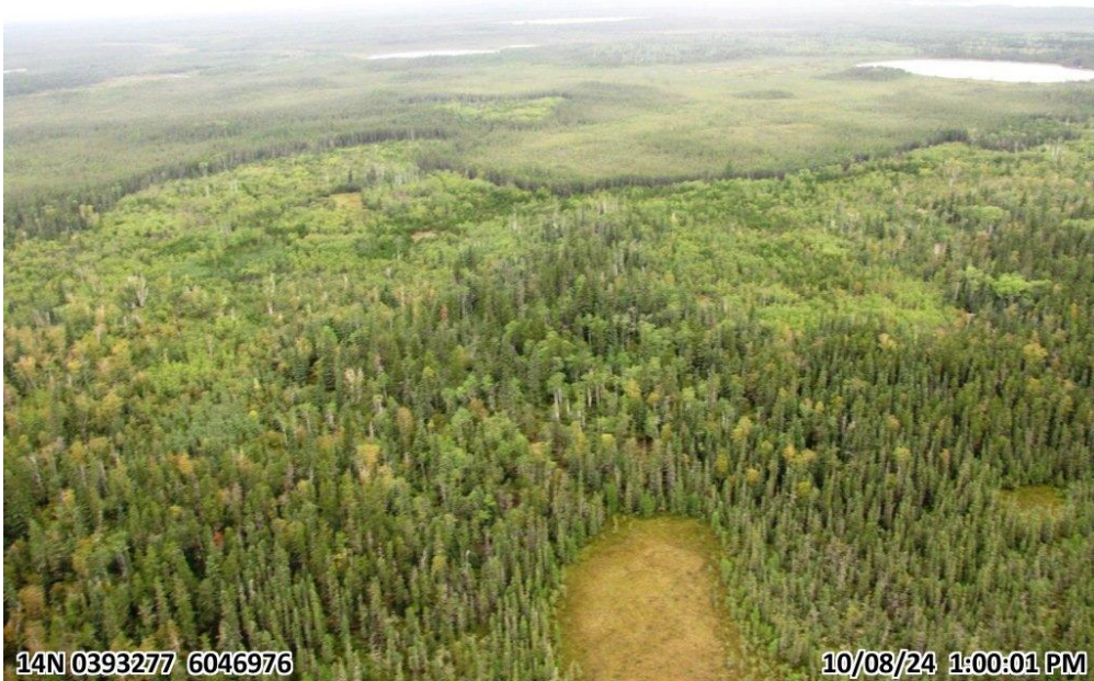
Photo - 12. Clear-Cut Area (foreground) and Mature Mixed Wood Forest Area (background) ↑