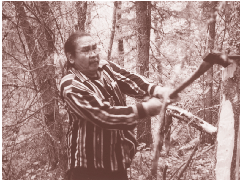
Preparing a corner post for claim staking

Developed through a unique partnership between Indian and Northern Affairs Canada, Natural Resources Canada, University College of the North (UCN), Assembly of Manitoba Chiefs, Mining Association of Manitoba and the province, the Introduction to Prospecting Program is now being offered through UCN in The Pas.