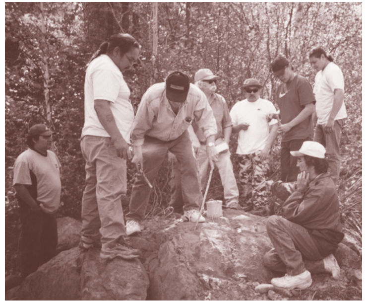
Using blasting techniques to collect mineral samples