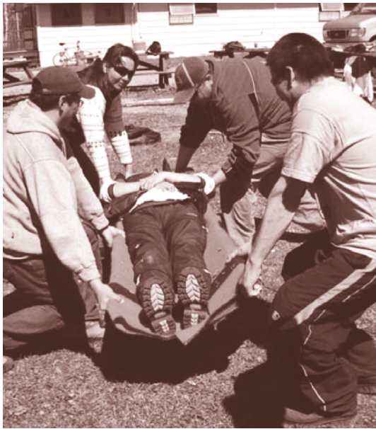
First aid training for wilderness safety