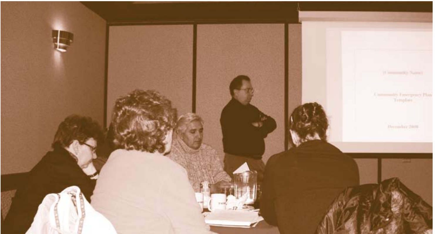
North Central Region Administrative Officer Workshop featured a mix of presentations and a visit with Brandon administrators.

ANA thanks all attendees and workshop presenters for their participation. Special thanks go to the City of Brandon for sharing information with the Community Administrative Officers.