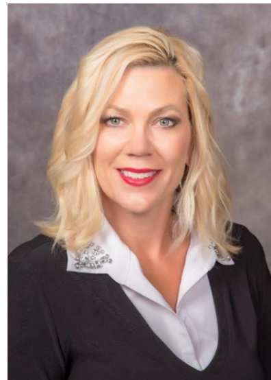
Honourable Rochelle Squires Minister of Municipal Relations

A handwritten signature in blue ink, appearing to read "R. Squires".