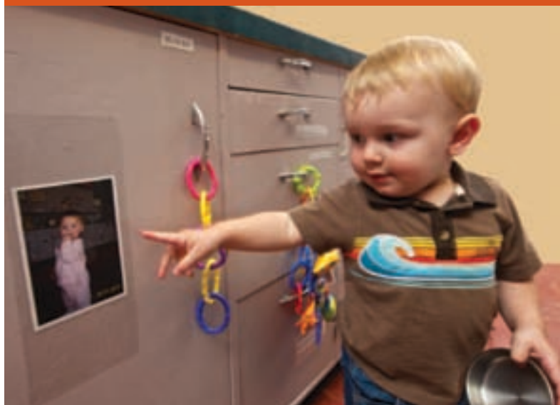
Post photos within the children's easy reach; children feel a sense of belonging when they can see photos of themselves, their peers and their families.

Incorporating diversity and inclusion in your curriculum is a benefit to children, families and staff because it helps develop a sense of belonging. This sense of belonging is essential to ensuring that programs respond appropriately to the rich diversity that is present in our families and communities. It also strengthens understanding and acceptance of similarities and differences so everyone can learn from each other.