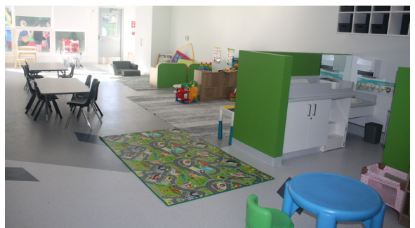
Interior view of the new play area

For more information on ELCC’s child-care space creation efforts and/or grant funding that may be available for a space expansion project, visit: Manitoba Early Learning and Child Care: Space Creation .