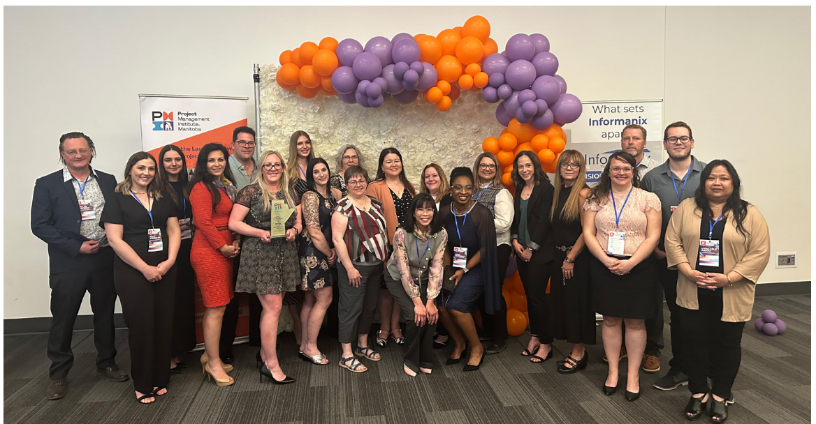
Members of the RTM Team

Read more on the Project Management Institute website.