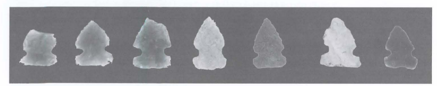
These arrowheads are examples of archaeological heritage objects.