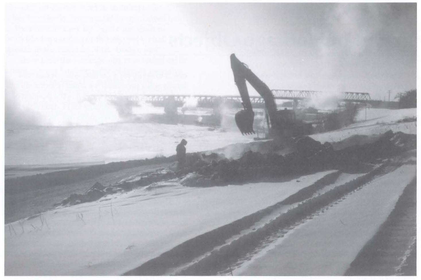
Recovering heritage objects from the Lockport West Site.

The Heritage Resources Act, the Minister and the Historic Resources Branch. If an object is discovered quite by accident, and it still appears to be in place in the ground, it should be left there and the Historic Resources Branch informed. Such a discovery could prove important to an understanding of local or provincial history. Human remains should never be disturbed, but rather reported immediately to the Historic Resources Branch.