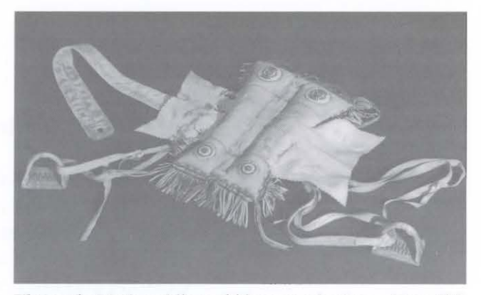
This early Metis saddle could become a heritage object, if it were so designated by regulation.