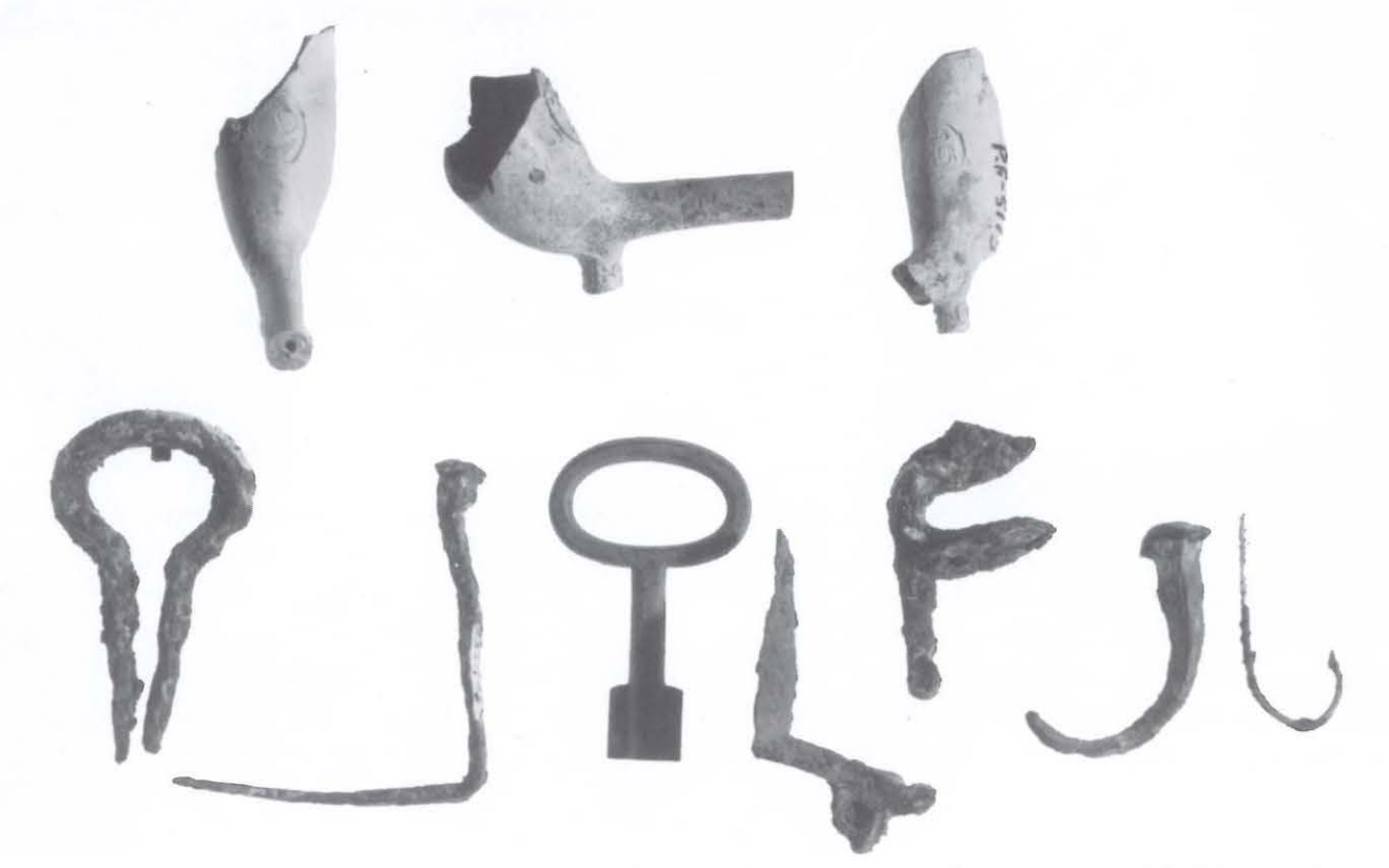
Historic artifacts from Manitoba: (top) tobacco pipes, (bottom) a mouth harp, a square nail, a key, gun parts (a frizzen and a hammer), a handwrought nail and a fishhook.

collected and studied, they can yield valuable information about Manitoba's past. It is the information contained in fossils and artifacts that makes them important. Usually they are the only way to know much about ancient Manitoba. It is important to preserve and protect these objects because they link today's Manitobans to the province as it was centuries, millenia and millions of years ago.