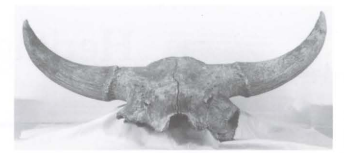
This partial skull of an extinct species of bison is another example of a palaeontological object.

Items such as these, known as "moveable cultural property", may be protected by being "designated" as heritage objects. The protection and preservation of such designated heritage objects is primarily a matter of public awareness and education in order to encourage their proper care and retention in the province.