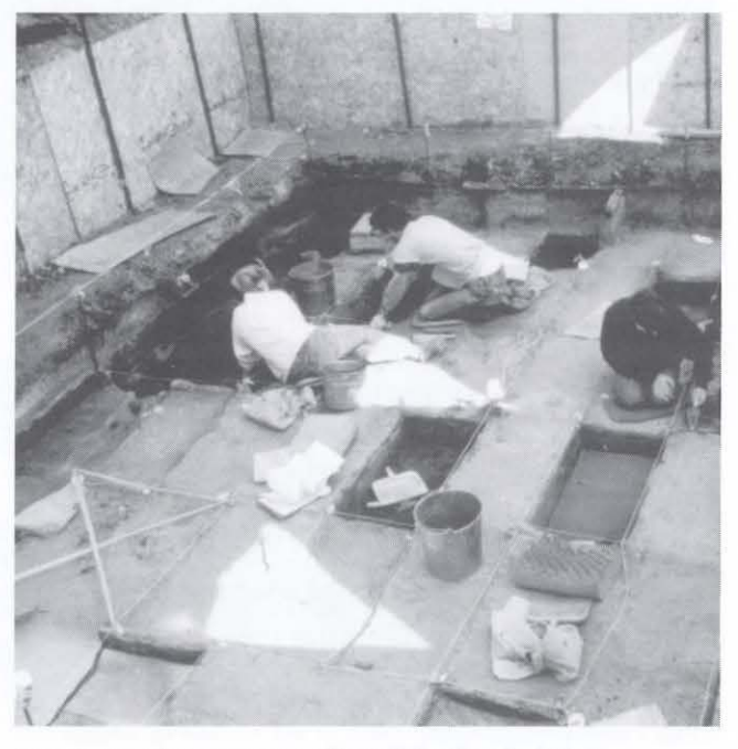
Excavation in progress at Fort Gibraltar I.

However, the Act also explicitly provides for private citizens to retain newly-found archaeological, palaeontological, or natural history objects. This provision is important because many amateur archaeologists in