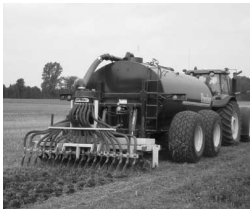
Low disturbance type applicator system

For forage crops and direct seeding systems, low disturbance, disk-type injectors have the ability to inject large volumes of liquid pig manure with very little residue or soil disturbance. High disturbance shank-type injectors, using sweeps or spikes, create considerable soil and residue disturbance. However, they may produce less odour than the low disturbance injectors. Both types of injectors should provide acceptable liquid placement at generally practiced rates of manure application. Another type of low disturbance applicator has a series of knives mounted on an axle which penetrate the soil creating a soil aeration effect. Liquid manure is delivered through a drop hose behind or in front of each knife set and into the holes. This low disturbance applicator is an excellent tool for minimum till, zero till applications, or forage fields as it allows for immediate infiltration of the manure into the soil while greatly reducing the odour versus surface application.