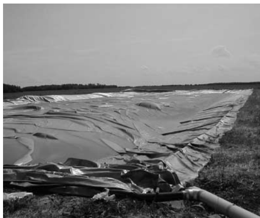
Synthetic cover on an earthen manure storage in Manitoba

Difficulty during the pump-out of straw-covered earthen storages has been a concern. However, plugging of pumps or outlet nozzles on transport tankers are rare and can be generally attributed to insufficient agitation. Directing the agitator nozzle to large straw clumps and having an agitator with chopper blades mounted on the end of the pump to help break up and shred straw clumps helps to create a homogeneous product that can be pumped more easily.