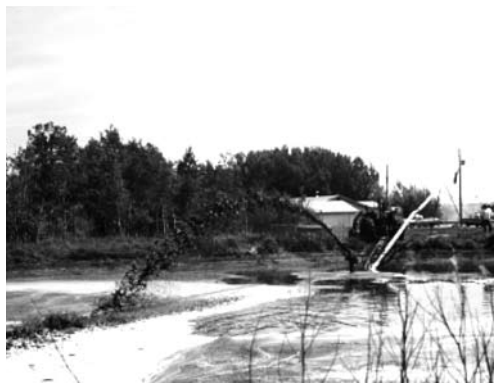
The agitation required to pump solids out of the storage structure releases considerable odours

A significant advantage of earthen manure storage structures is that they are often designed with sufficient volume to only require emptying and application once per year. The more expensive concrete structures are often constructed with a smaller storage volume, requiring both spring and fall emptying. Agitation of the manure during the emptying