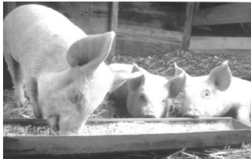
Straw-based housing system

Straw-based systems – Odours can be reduced by creating aerobic conditions for the manure. The use of straw or other bedding can maintain aerobic conditions if enough material is used. The labour requirement for material handling, however, is high.