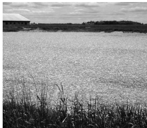
Straw cover on an earthen manure storage in Manitoba