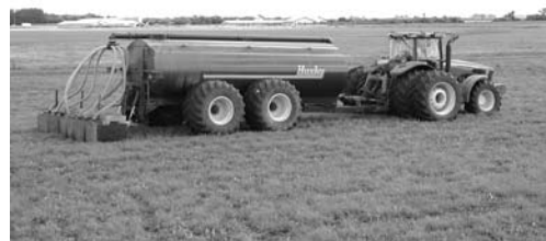
Tanker system used for applying manure

There are two types of direct injection systems. One system consists of injectors mounted on conventional manure tankers. The other system is the pipeline or draghose injection system, where a tractor powered implement, connected by a long flexible hose to a pump and irrigation