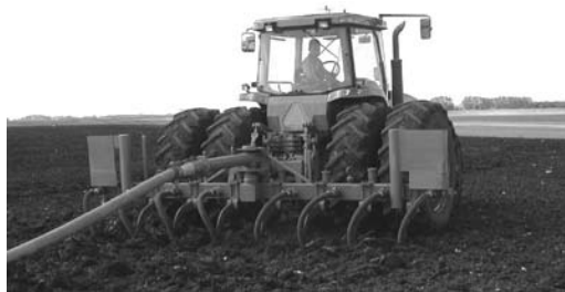
Draghose or pipeline injector for liquid manure

Storage aeration – Theoretically, aeration of a liquid manure storage structure should change the decomposition process from anaerobic to aerobic and reduce unpleasant odours. Manitoba winters and the high costs associated with equipment and operation have prevented the widespread use of aeration as a means of controlling storage odours. Aeration and other methods of treatment are discussed in greater detail in Appendix D.