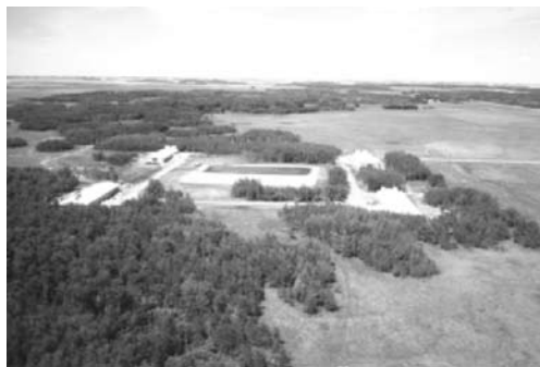
Maintaining trees around the yard of a livestock operation is an asset

Historically, landowners have designed shelterbelts to meet their personal needs and/or improve farm efficiency. Since each farm is different, there is no simple recommendation on how to design a shelterbelt system. Although Agriculture and Agri-Food Canada’s (AAFC) Basic Shelterbelt Establishment Guidelines can be found in Appendix J, it is essential to understand that the context and purpose of this document is to provide generic advice that can be adapted to suit