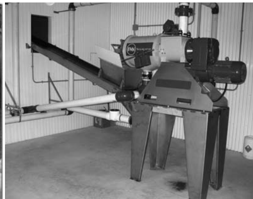
Screw press solid/liquid separator