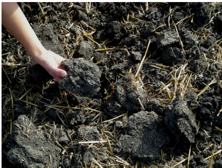
Figure 1. Typically “lumpy soil” resulting from tillage of dry, clay soils in fall 2012.