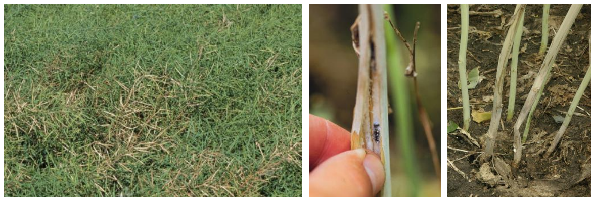
Stem rot in canola, contrast with healthy plants

Canola crops with a dense canopy, left without the protection of a fungicide, might see infection rates of 10 – 25% and subsequent yield losses of 5 – 13%. One might see a greater proportion of infected plants in low spots in a field and notice them because of the strong contrast of straw-colored plants with healthy green ones.