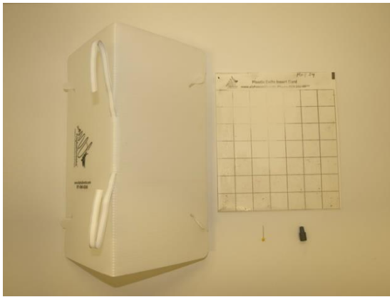
Figure 1. Trap components: Delta trap, insert, pin, and lure.