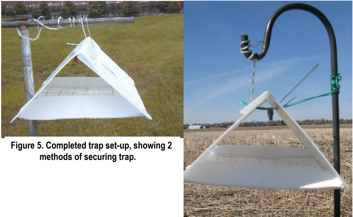
Figure 5. Completed trap set-up, showing 2 methods of securing trap.

6. A T-shaped bar can be inserted into a hollow metal pole, which is hammered into the ground, so there is a horizontal surface to hang the trap from. Or a bent piece of rebar, or other horizontal surface, can be used to suspend the traps from. Alternatively, a hooked stake, which can be purchased from stores selling garden supplies, can be used to suspend the traps from. (Figure 5).