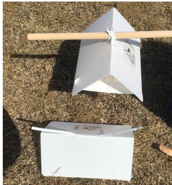
Figure 6. Delta trap secured in place using twist tie.

7. Depending on the supplier, the delta trap will either have a plastic twist tie at the top, or come with a bendable metal wire that can be secured into holes at the top of the trap. The twist tie or wire can be wrapped around a stake or one of the horizontal ends of a T-shaped bar to secure the trap in place.