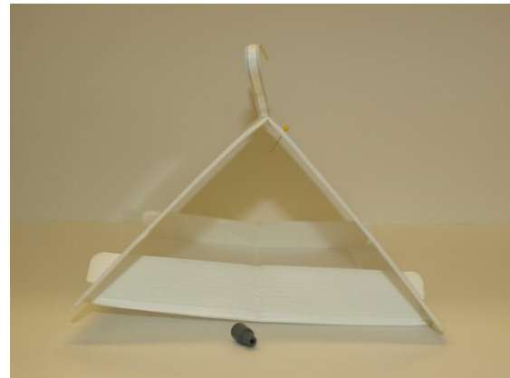
Figure 2. Pin inserted.

3. Pin the rubber lure so the pin extends through the narrow top of the lure (Figure 3). The rubber stopper containing the pheromone should hang from the top of the trap. Do not handle the lures with your bare hands. Wear rubber or latex gloves or use tweezers to handle the lures. Store lures below 0°C when they are not in the trap.