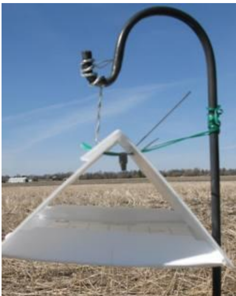
Figure 1. Trap for diamondback moth

Pheromone-baited traps (Fig. 1), which attract the male moths, are established for a 6-8 week period from early-May until late-June to detect the arrival of populations of diamondback moth early in the season. The cumulative counts from the traps, and how early larger numbers of moths arrive, cannot predict what levels of larvae will be, but can be used to determine regions of the province where increased attention for diamondback moth is recommended when scouting fields.