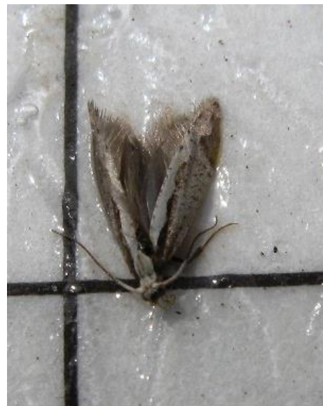
Figure 2. Diamondback moth on insert of trap