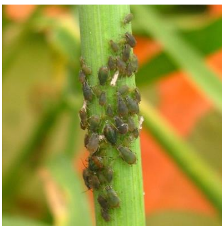
Figure 2. Oat-birdcherry aphid