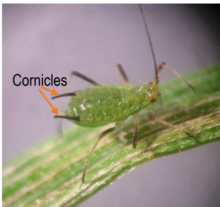
Figure 1. English grain aphid