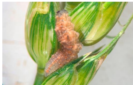
Figure 5. Hover fly larva.

Heavy rain and strong wind may knock aphids from the plants, decreasing populations of aphids on cereal crops.