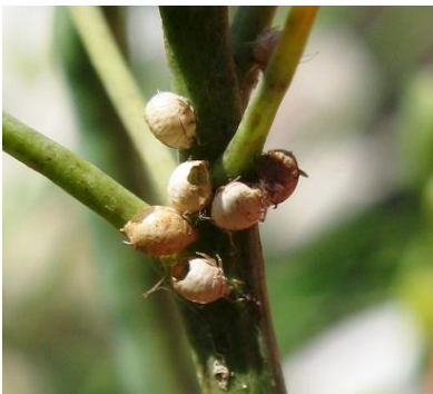
Figure 4. Aphid "mummies" - swollen, dead aphids that have been tanned and hardened due to parasites. Note the holes where the parasites emerged from some of the aphids.

Biological controls: Natural predators (such as lady beetles, hover fly larvae and lacewings) and parasites usually keep populations of aphids under control. For more information on predators and parasitoids of crop feeding insects, see the factsheet http://www.gov.mb.ca/agriculture/crops/insects/pubs/predatorsofinsectsfactsheet.pdf